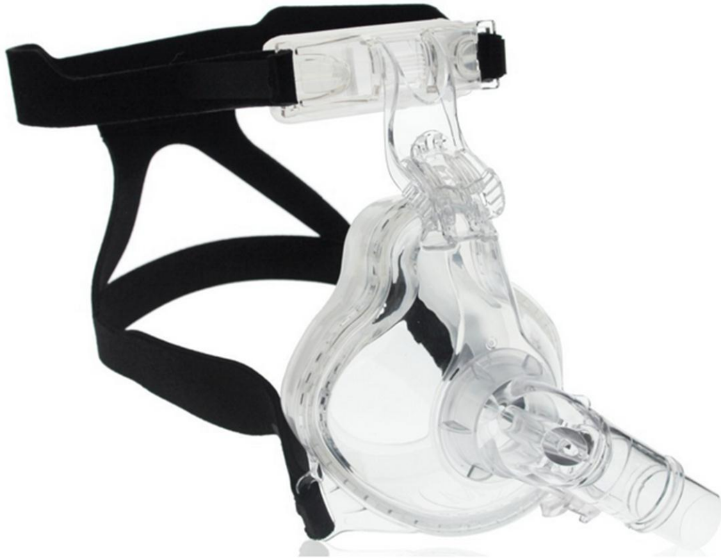
Full-face mask (FM03)