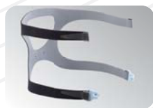
Biocompatible Breath-O-Prene™ headgear.