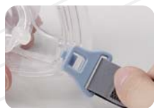
Easy-to-use headgear buckle (One-hand operated).