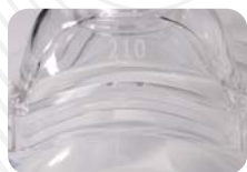
Model no. and size embossed on the frame and cushion for easy identification.