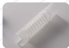
Soft hose with better flexibility.