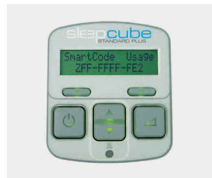
SleepCube with SmartCode display