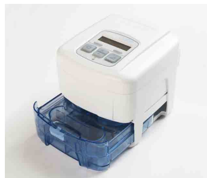
SleepCube with integrated heated humidifier