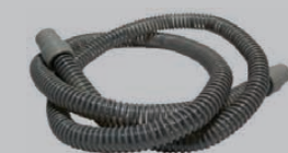
Tube system without integrated pressure measuring tube