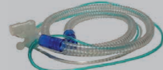
Single line patient circuit for ventilation