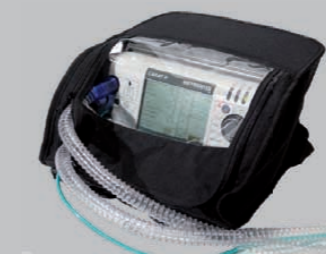
CARAT I und II