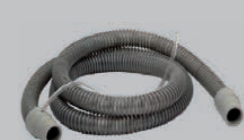
Tube system with integrated pressure measuring tube