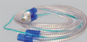
Double line patient circuit for ventilation