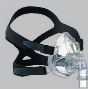
NIPPV mouth nasal mask