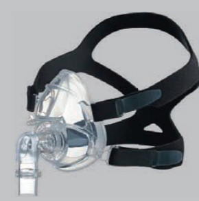
Mouth nasal mask