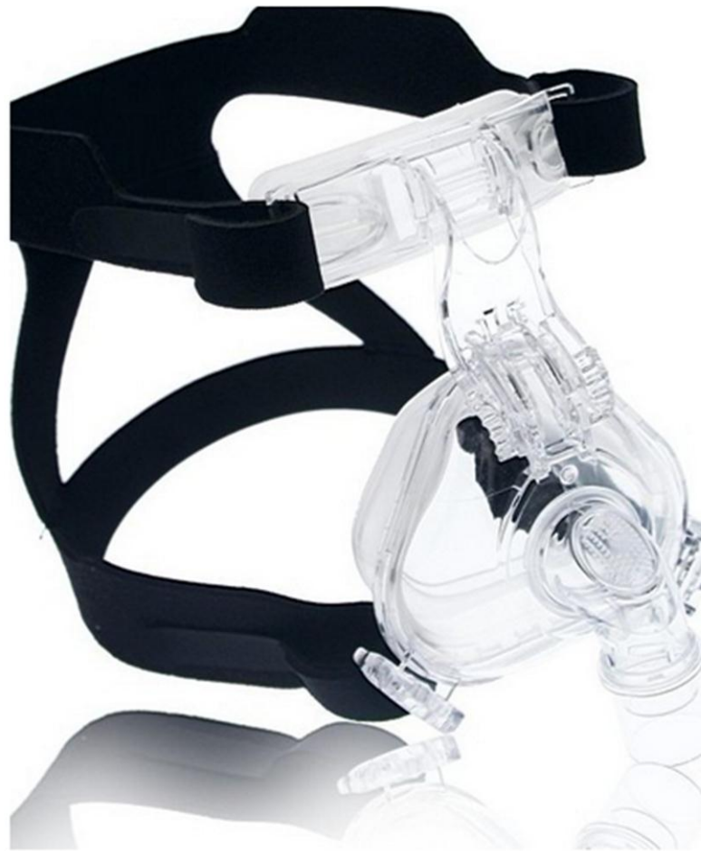
Nasal masks (NM01)