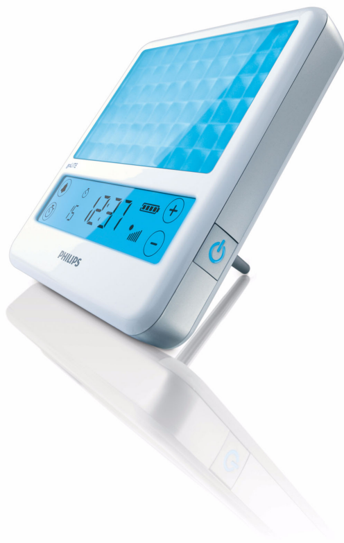
Philips goLITE BLU energy light